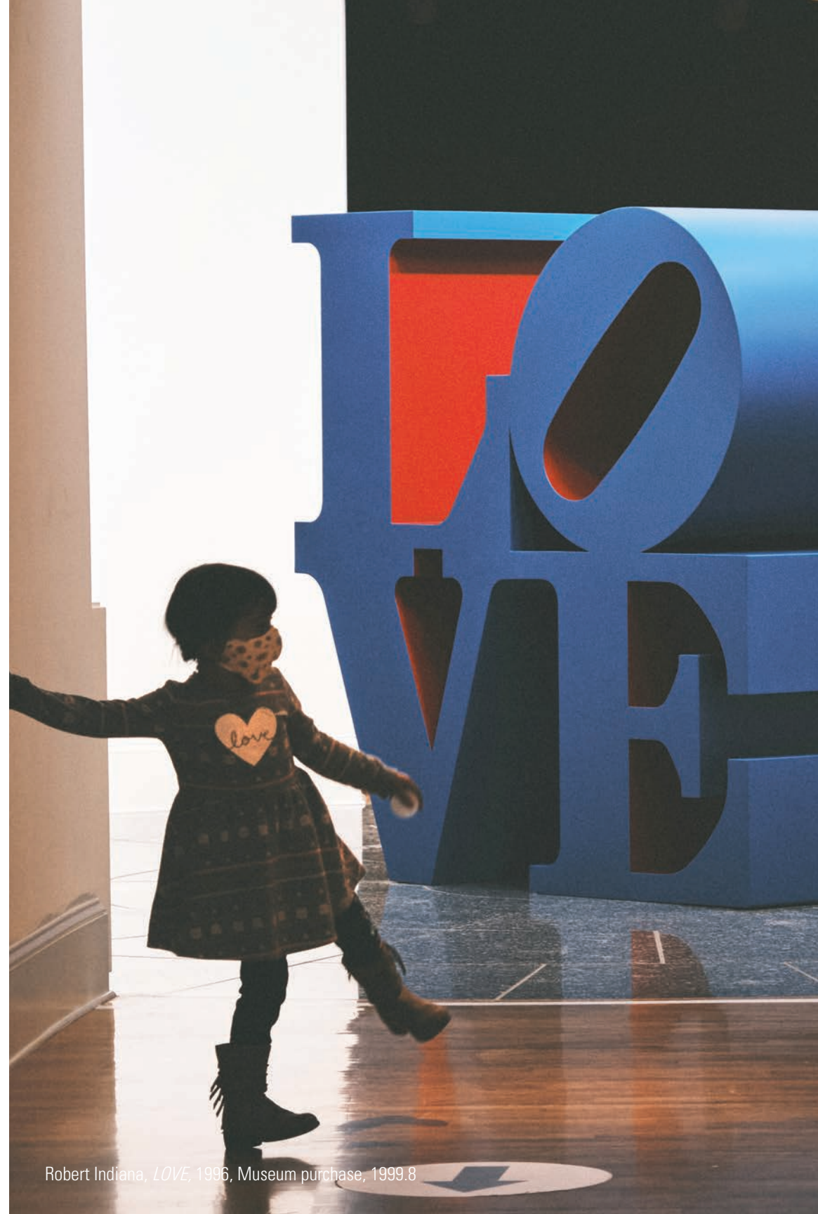
Robert Indiana, LOVE , 1996, Museum purchase, 1999.8